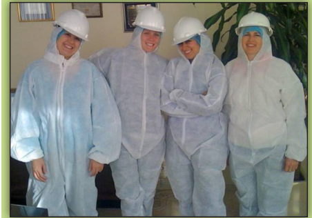
OSU students at the Carrasco slaughterhouse