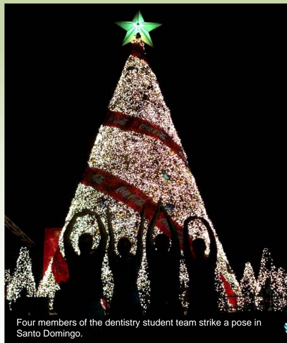
Four members of the dentistry student team strike a pose in Santo Domingo.

The OSU College of Dentistry is the 5 th largest in the US with an array of academic programs. There is a strong culture supporting interdisciplinary research through ongoing relationships with programs such as the Institute of Behavioral Medicine Research and the Comprehensive Cancer Center. Two current projects are the Ohio Project ($1.5 M-Robert Wood Johnson Foundation) and the Health Outreach Mobile Experience (funded by the Delta Dental Foundation and other partners) which translates dental education to underserved community-based sites. Dentistry's faculty and students work with Shoulder-to-Shoulder (Honduras) and the Global Youth Partnership for Africa (Uganda), and its pre-doctoral students have traveled to developing countries to provide educational services, health screenings, and dental services.