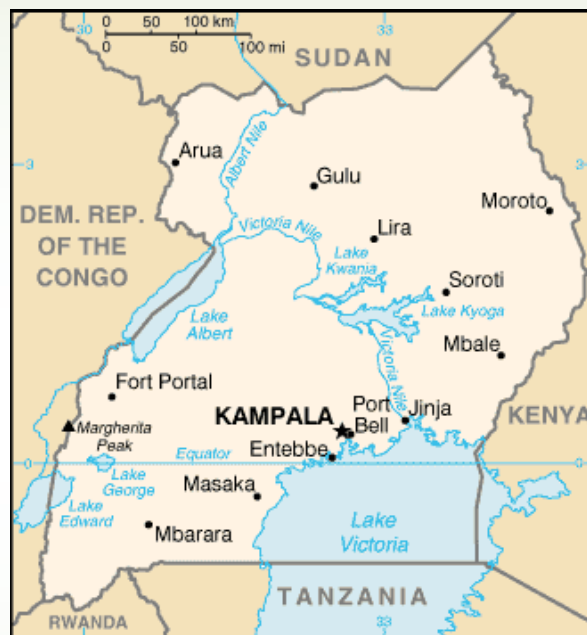
Map of Uganda from The World Factbook, CIA.

This past December an elective course in global veterinary medicine was offered to veterinary medicine students and Veterinary Public Health (MPH-VPH) students. Cultural and intellectual issues when traveling and working in the veterinary public health field abroad or in non-traditional veterinary medicine practices were discussed. Adaptation and proper interaction with diverse cultures were the main emphasis. The class was interactive and one session included federal agency representatives and others who discussed opportunities in global veterinary medicine and public health. Twenty-seven veterinary and MPH-VPH students attended this course.