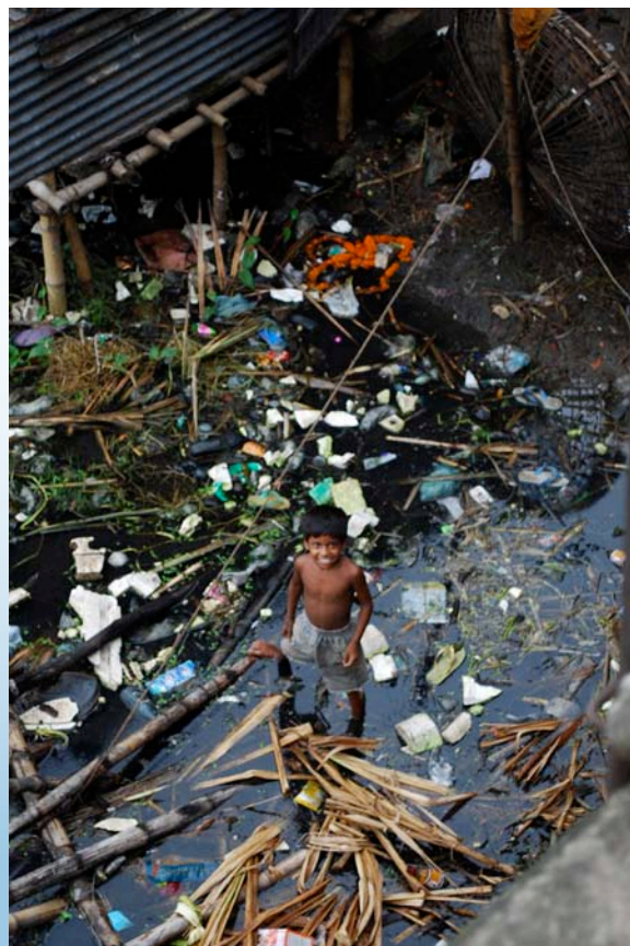
Contaminated water supply in Bangladesh