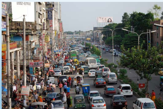
Overcrowded conditions in Bangladesh