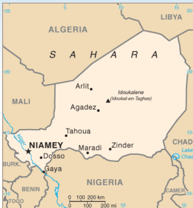
Map of Niger