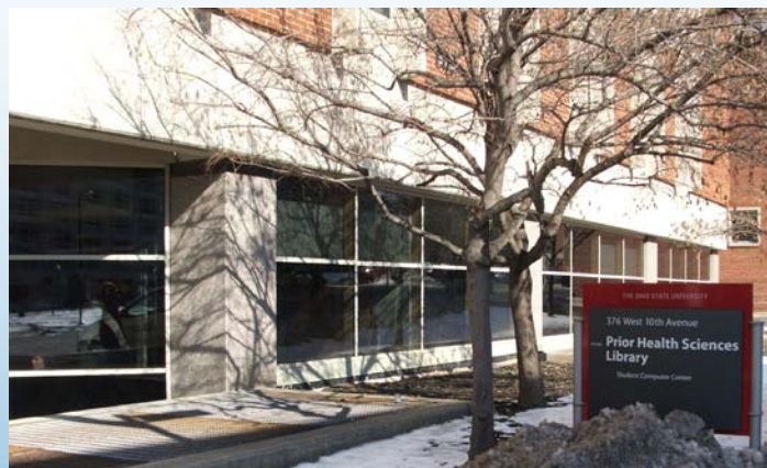
The new Health Sciences Center for Global Health is located in Suite 165 of the Prior Health Sciences Library.

In that spirit, the following special feature highlights the OSU Health Sciences Colleges and their global health activities here and around the globe. In the coming year, The Global Address will bring you stories of the exciting new initiatives that are being developed.