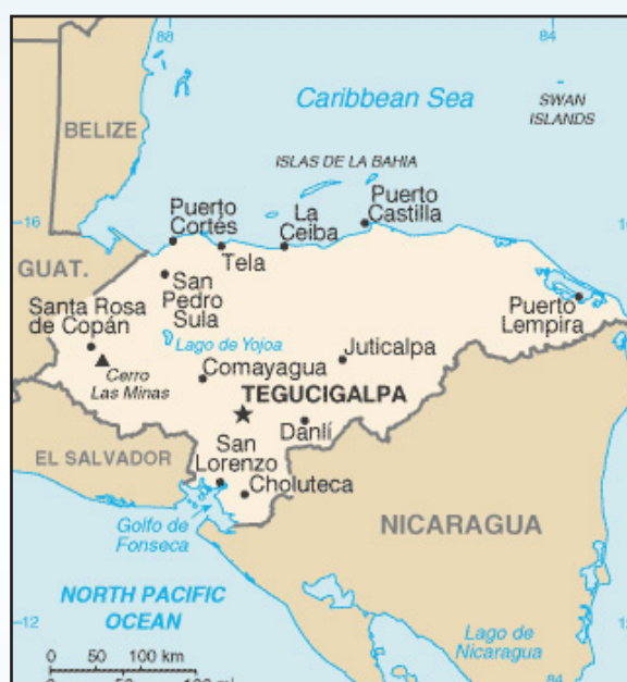
Map of Honduras from The World Factbook, CIA.

This experience not only provides the Honduran patients with sustainable, high-quality health care, but it also fulfills the College's objective for global outreach. In addition, the trip provides the students with an unforgettable and intense experience in the challenge of health care where there is little or no technologic support.