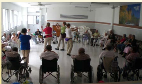
OSU physical therapy faculty and students conduct an exercise class at a nursing home in Merida.