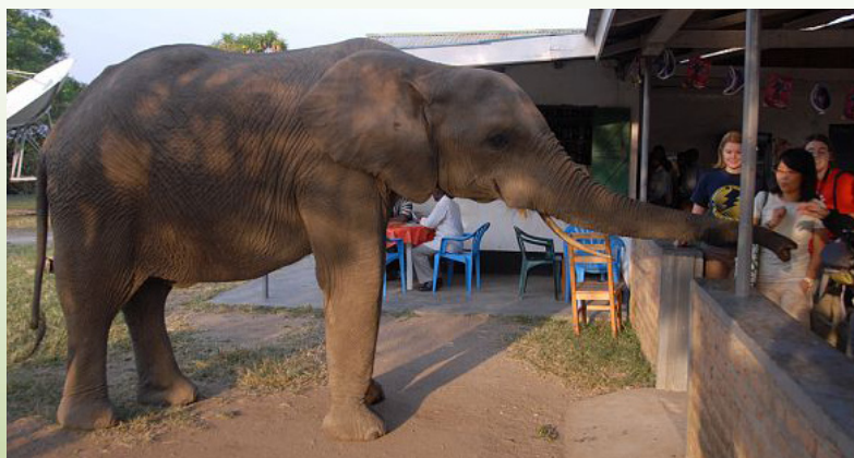
Left: MPH-VPH student Megan Whitehead collecting information about lions in a national park in Uganda.