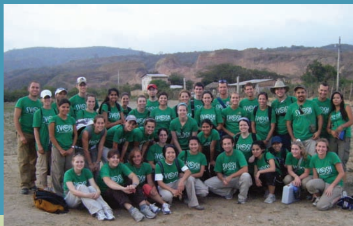
Above: 2008 SVOSH group in Ecuador